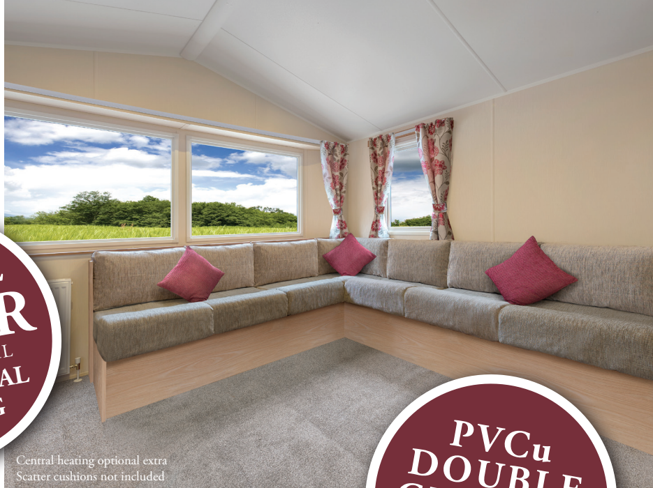
Central heating optional extra Scatter cushions not included

SPECIAL OFFER ON OPTIONAL GAS CENTRAL HEATING