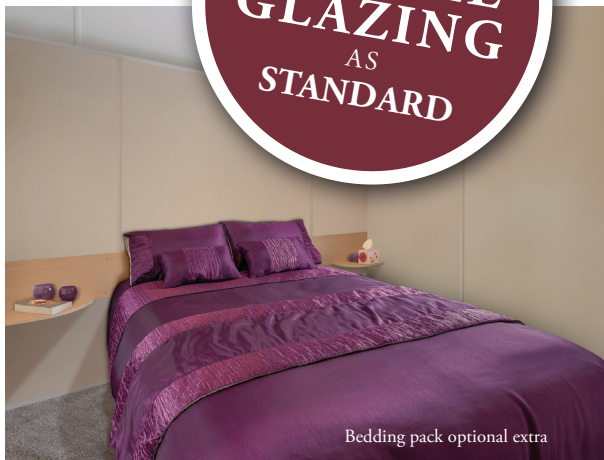
Bedding pack optional extra